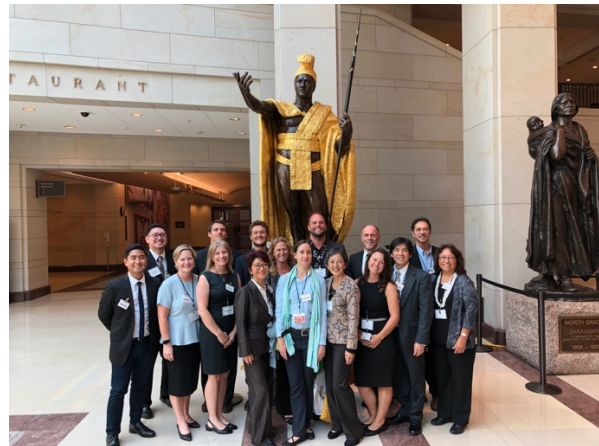
ALP Class XVI visits Capitol Hill.