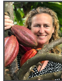
Yarrow Flower Bayer