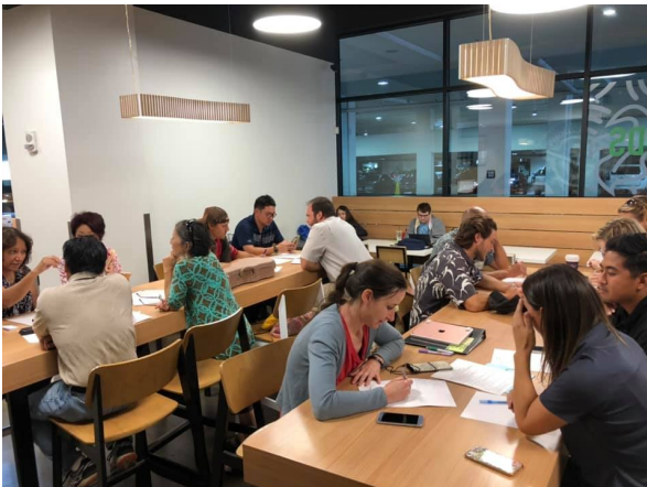
ALP Class XVI Participants work in teams to plan the National Trip.